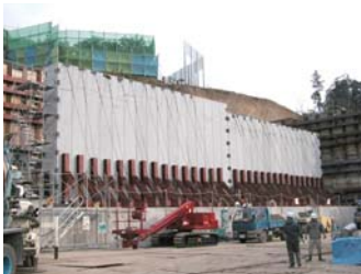
Revert T Retaining Wall