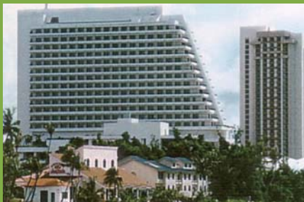
Guam Earthquake (Hotel Pacific Star)

No damages after the three major earthquakes.