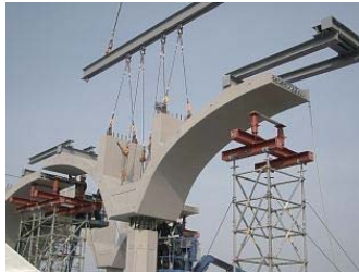
Sui-Sui Swan Method