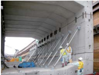
Connection between arch and wall