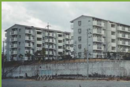
Kobe Earthquake (middle high condominium)